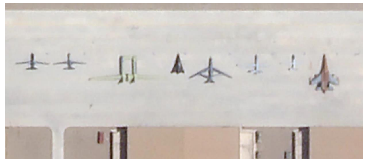
Figure 4: Flanker fighter aircraft (far right) parked on tarmac with UAVs at Malan airbase, dated June 1 202193

MUM-T testing would likely occur under the auspices of the PLA Air Force's Testing, Experimentation, and Training Base (空军试验训练基地), also known as Unit 95861.<sup>90</sup> The unit claims prominent UAV test pilot Li Hao (李浩) and Zhao Xu (赵煦), regarded as China's "father of UAVs," as members of the unit.<sup>91</sup> Some of this testing may be occurring at Malan airbase, which according to unofficial observers hosts PLAAF UAV training brigade Unit 95835 and in June 2021 displayed a Flanker fighter next to a series of other UAVs, prompting further speculation from Western observers that the PLA was testing MUM-T techniques and technologies.<sup>92</sup>