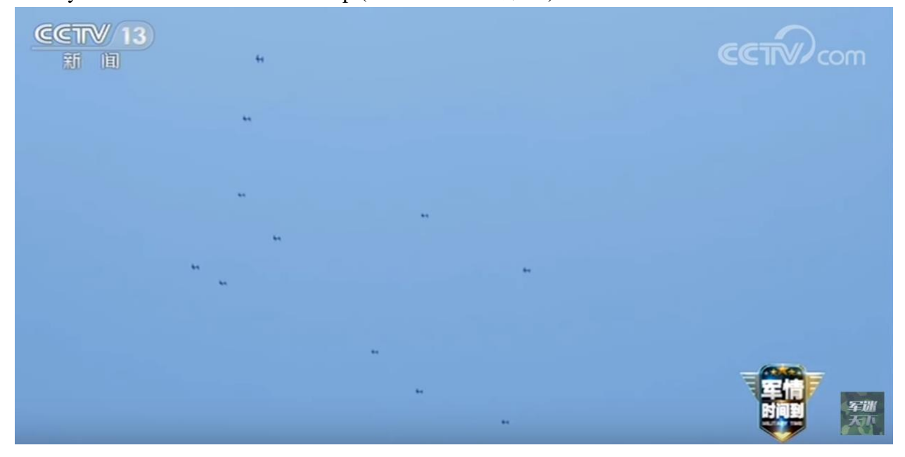
Figure 7: Test footage from October 2020 showing a swarm of loitering munitions rearranging aerial formation<sup>107</sup>

another truck-based UAV launcher was exhibited in November 2022 at the Zhuhai Airshow, this time by China South Industries Group (中国兵器装备集团).<sup>106</sup>