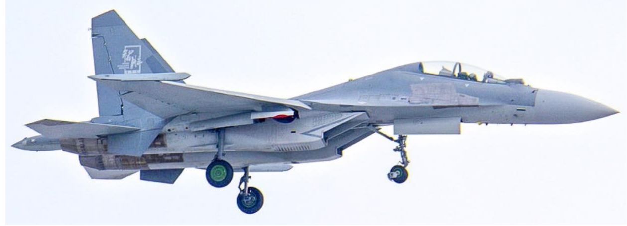
Figure 3: J-16 testbed aircraft reportedly equipped with an artificial intelligence algorithm<sup>89</sup>

Western observers have speculated that the PLA is devoting considerable energy to operational testing and evaluation for MUM-T platforms. In March 2021, several unofficial Western observers reported that the Shenyang Aircraft Corporation was testing an artificial intelligence algorithm named "Intelligent Victory" (智胜) aboard a J-16 fighter aircraft based on rumors, an unoccupied backseat, and tail art with the characters for "intelligent victory."<sup>88</sup> Conjectures about PLA MUM-T testbeds arise frequently, but these occurrences could not be verified with any publicly available sources in English or in Chinese at the time of writing.