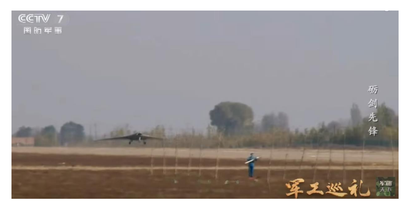
Figure 5: Sky Hawk UAV's first flight in November 201799

Perhaps a more mature example of MUM-T development is the Sky Hawk (天鹰). Designed by the Hiwing Aviation General Equipment Company (海鹰航空通用装备有限责任公司), a subsidiary of the China Aerospace Science and Industry Corporation's (CASIC) 3rd Academy, and tested by personnel from CASIC's 159th Factory, the Sky Hawk allegedly first flew in November 2017 after nearly four years of development, and made several appearances at airshows before being prominently revealed again to the public in February 2024.<sup>96</sup> The Sky Hawk team reportedly experienced significant difficulty in achieving long range flight with the compromises made for the aircraft's stealthy design, and was ultimately comprised of more than 80 percent new technology.<sup>97</sup> The Sky Hawk's chief designer Ma Hongzhong (马洪忠) and head of Hiwing confirmed in an interview with state media that the Sky Hawk had the capability to coordinate with manned aircraft, but offered no further details.<sup>98</sup>